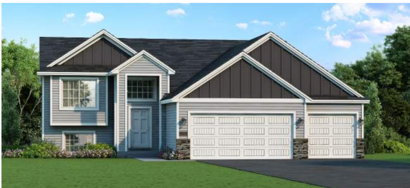
Elevation D (1345 - 2399 fsf)