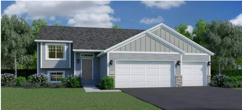
Elevation B (1345 - 2399 fsf)