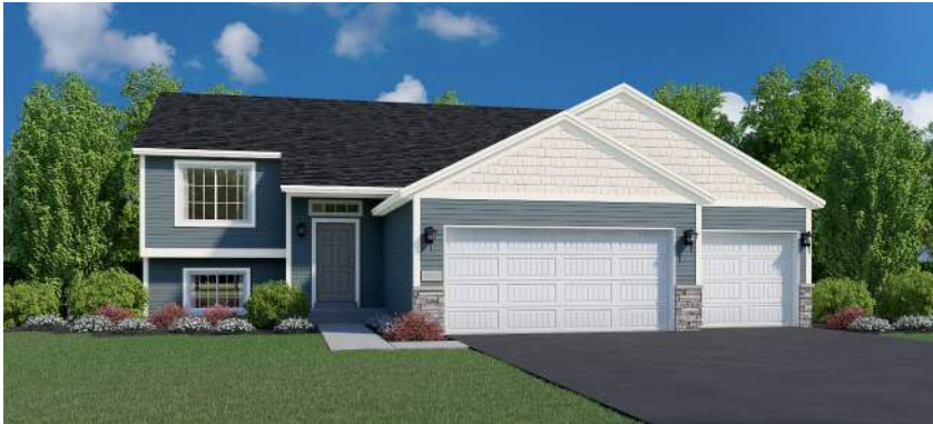
Elevation A (1350 - 2404 fsf)

3 - 5 Beds | 2 - 3 Baths | 3 Garage Bays | 1,345 - 2,404 fsf