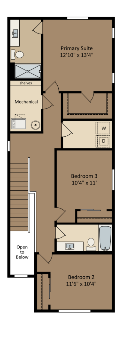
CENTRA HOMES LLC