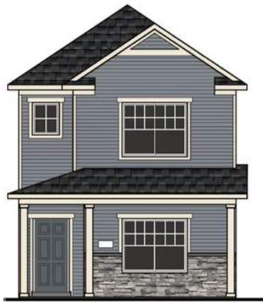
Elevation B (per community)