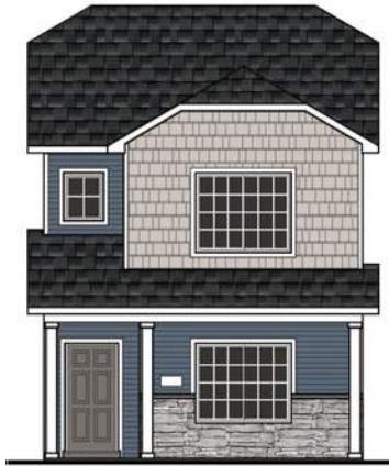
Elevation A (per community)

3-4 Bedrooms | 2.5 Baths | 2 Garage Bays | 1,930 fsf | Slab-on-grade