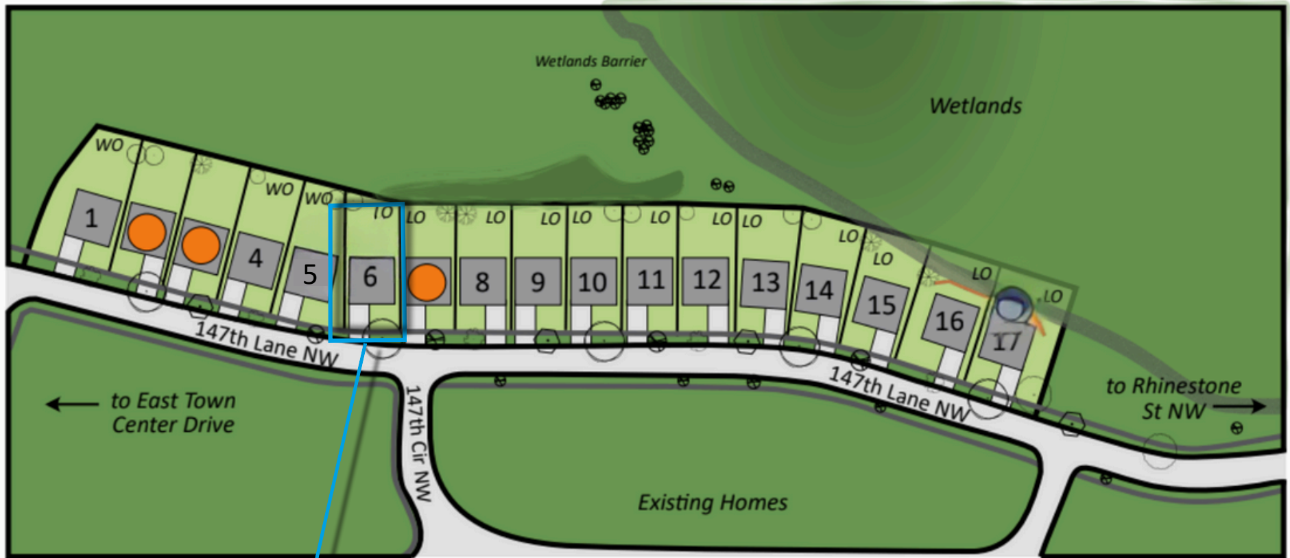
Lot 6, Block 1

4 Beds | 2 Baths | 2 Garage Bays | 1980 fsf